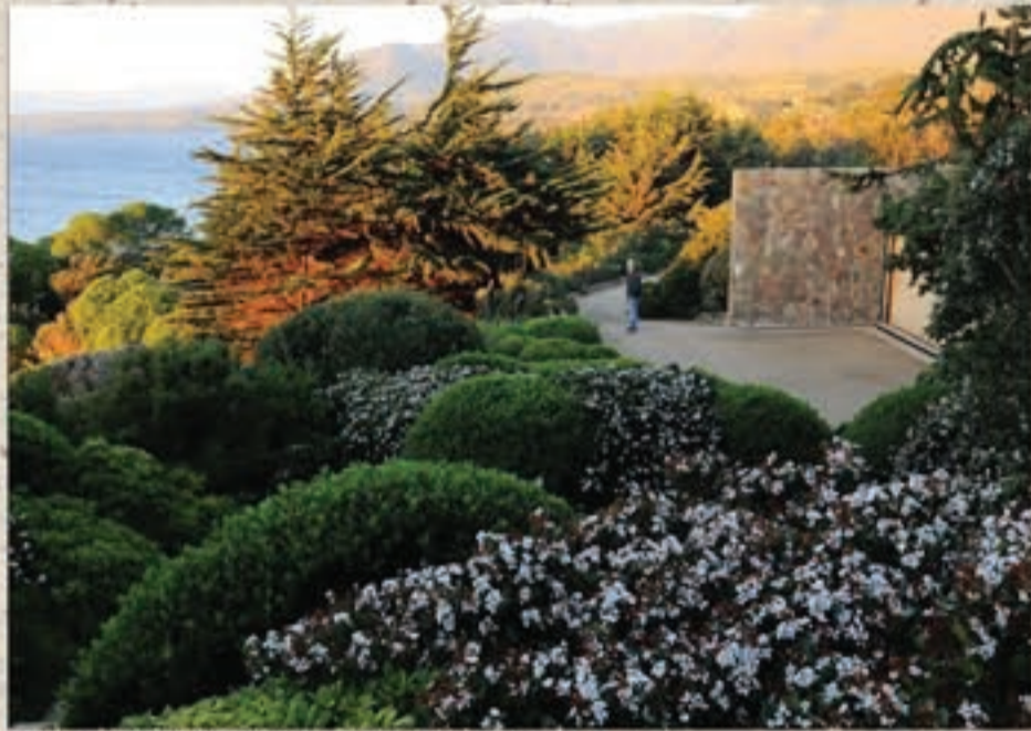
Main Picture: Bahia azul Garden designed by Juan Grimm